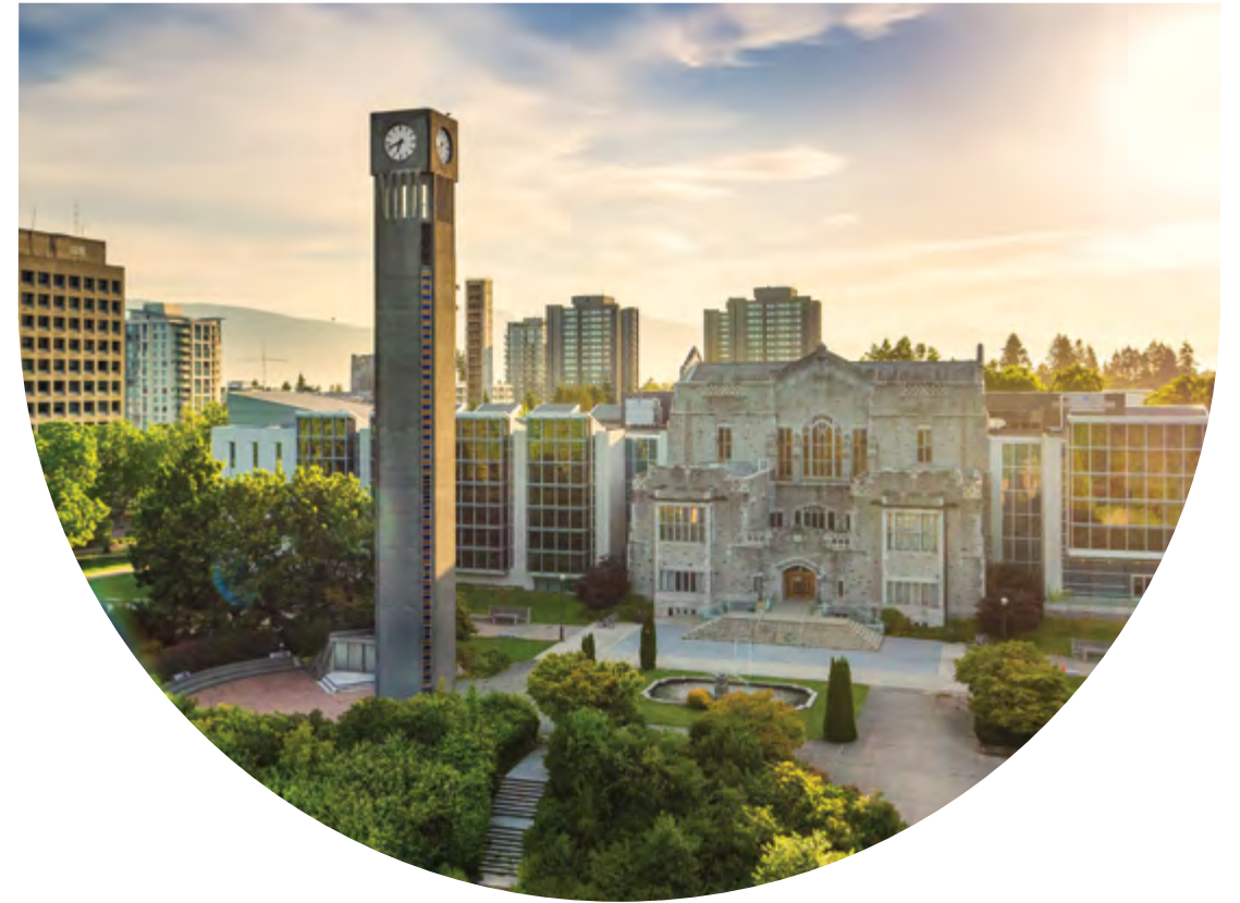
Above: Vancouver campus