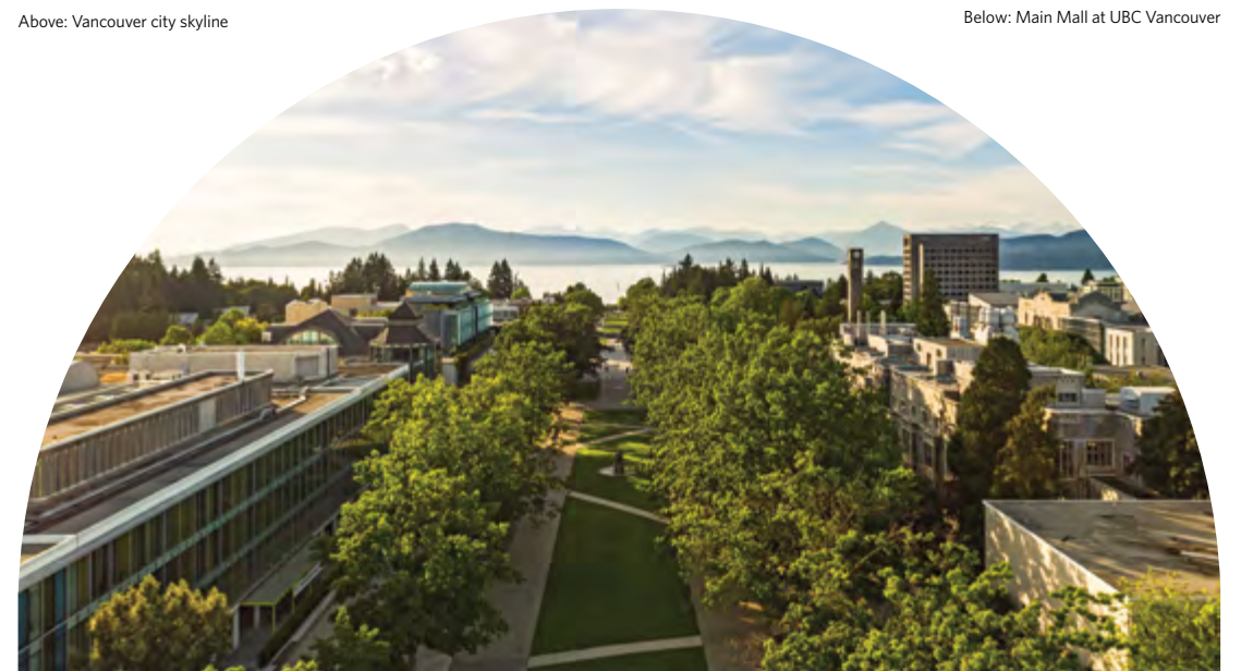
Below: Main Mall at UBC Vancouver

"I consider the UBC Vancouver campus another home to me because it is a place where I have found community and lifelong friendship. My experiences here have strengthened my desire to use my degree to connect with community and advocate for Indigenous representation in health and physical activity spaces."