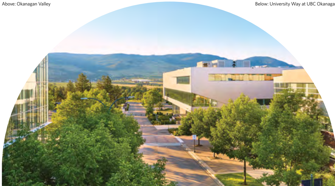
Below: University Way at UBC Okanagan