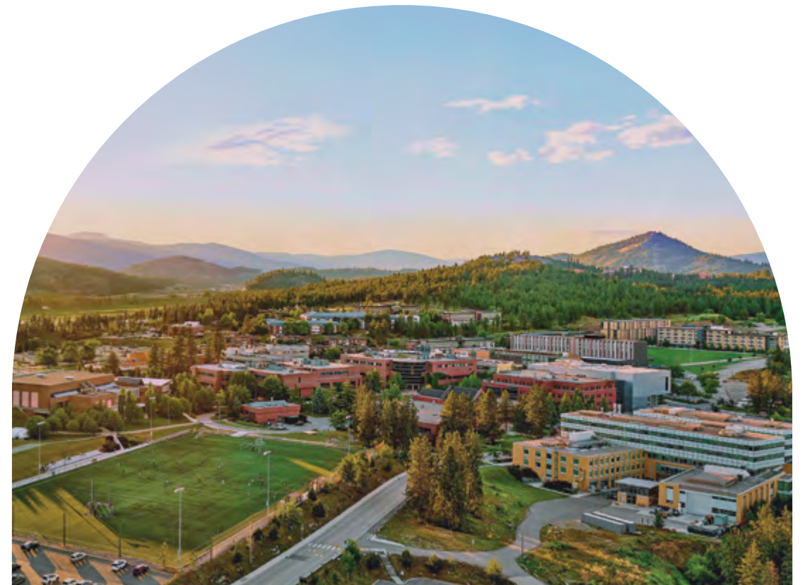
Below: Okanagan campus