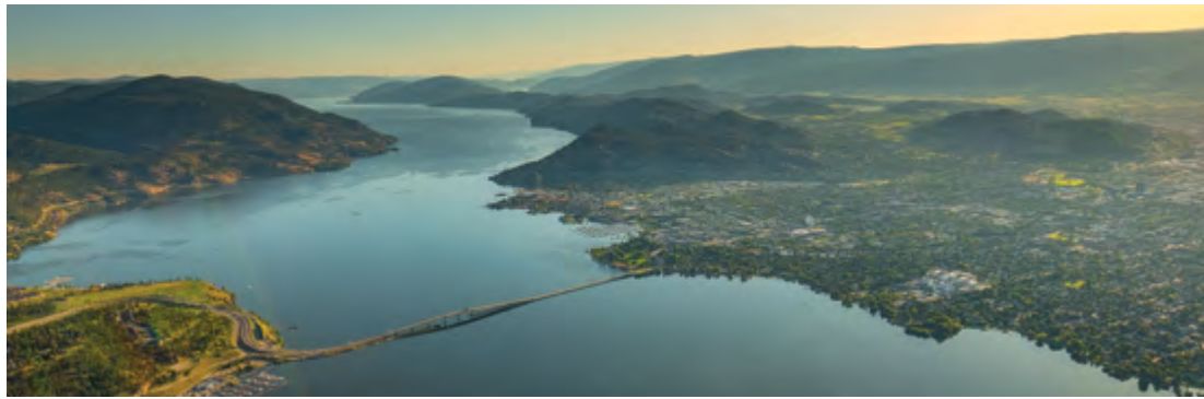
Above: Okanagan Valley