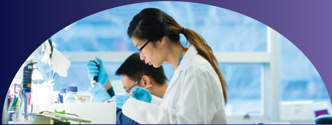
Student research at the UBC Prostate Centre.

With degrees in every major field of study, plus opportunities for specialization and co-op learning, there's no limit to what you can study during your time at UBC.