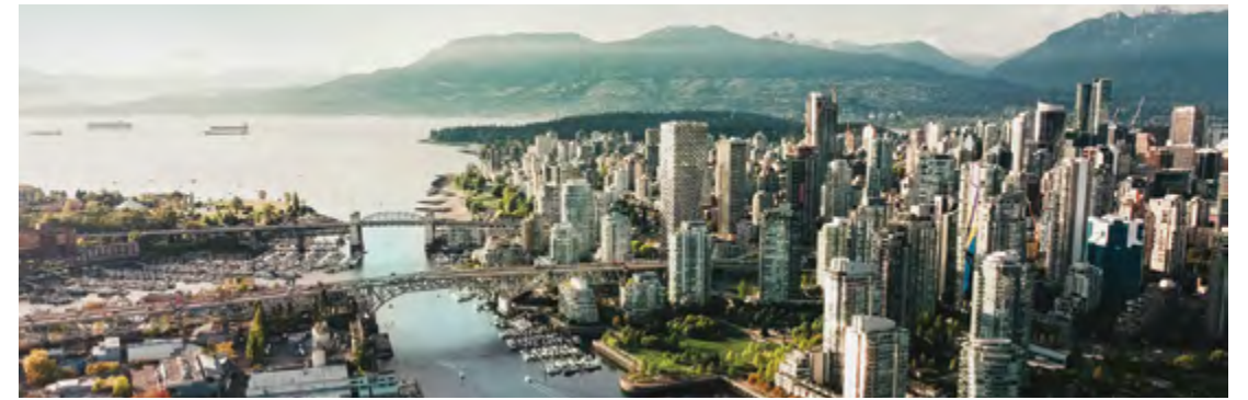
Above: Vancouver city skyline